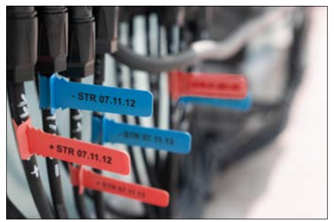
TAGPU LOOP - Cable marking solutions for labeling on the inverter.